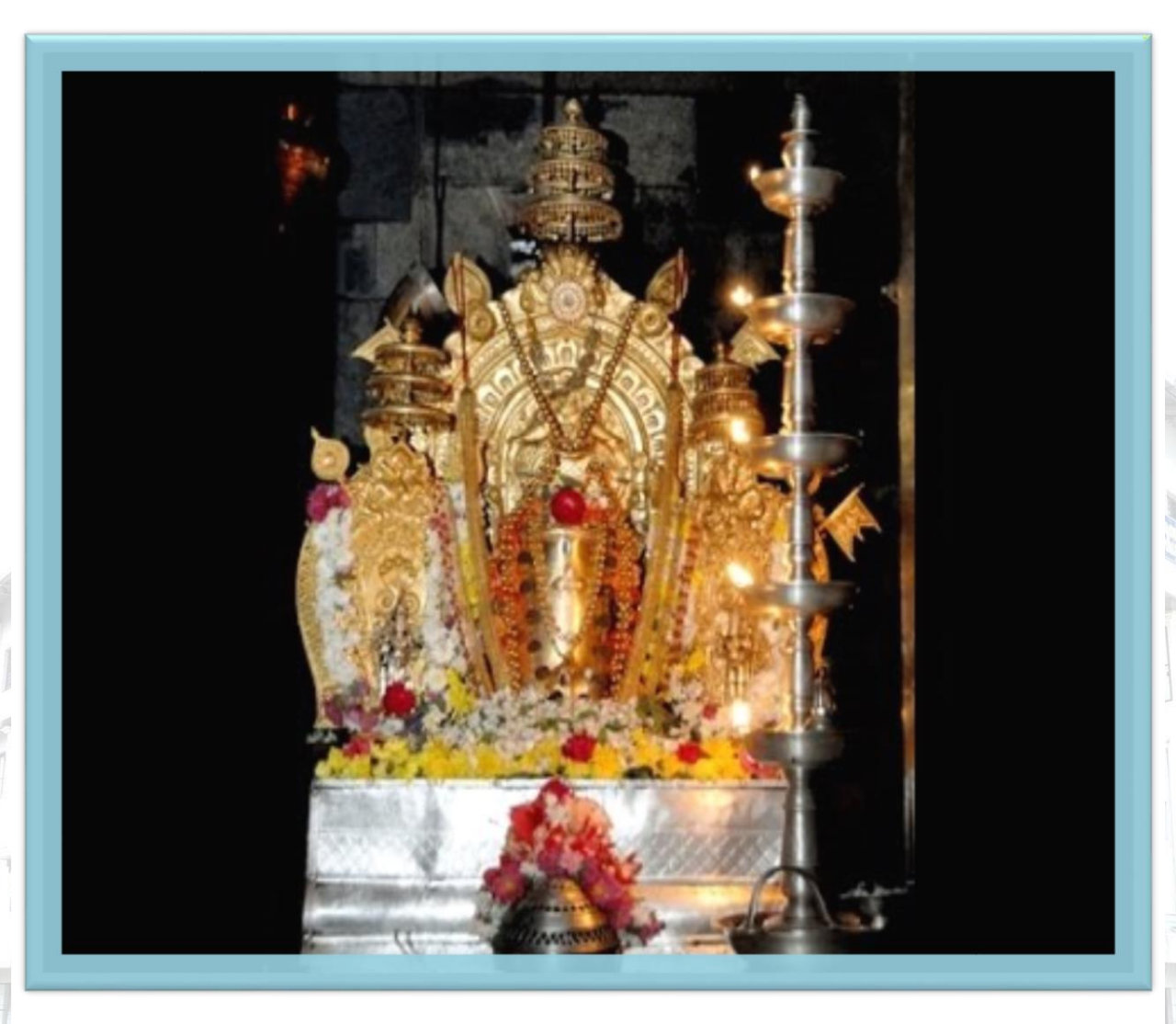
Lord Manjunatheshwara Dharmasthala