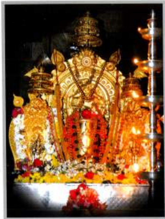
Lord Shri Manjunatha Swamy Shri Kshethra Dharmasthala