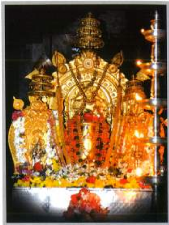
Lord Shri Manjunatha Swamy Shri Kshethra Dharmasthala