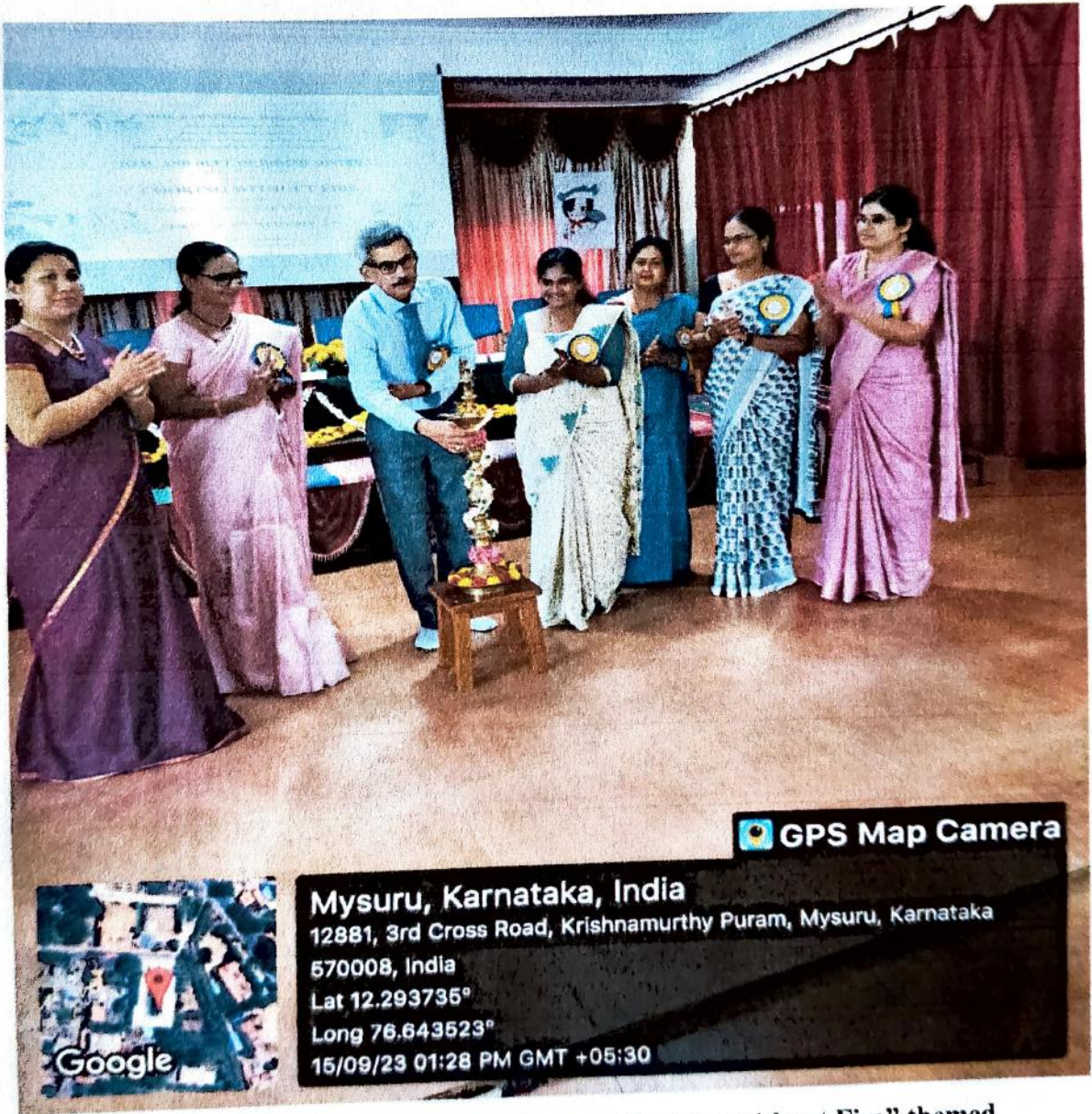
Inauguration Program of the Competition on "Cooking without Fire" themed "International Year of Millets"