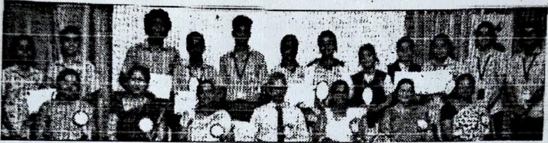
ಅಂತಾರಾಷ್ಟ್ರೀಯ ಸಿರಿಧಾನ್ಯಗಳ ವರ್ಷ ಅಂಗವಾಗಿ ಸಿರಿಧಾನ್ಯ ಅರಿವು ಮೂಡಿಸಿದ ಕುಕಿಂಗ್ ವಿತೌಟ್ ಫೈರ್‌ಸರ್ಧೆ ಆಯೋಜಿಸಲಾಗಿದೆ.