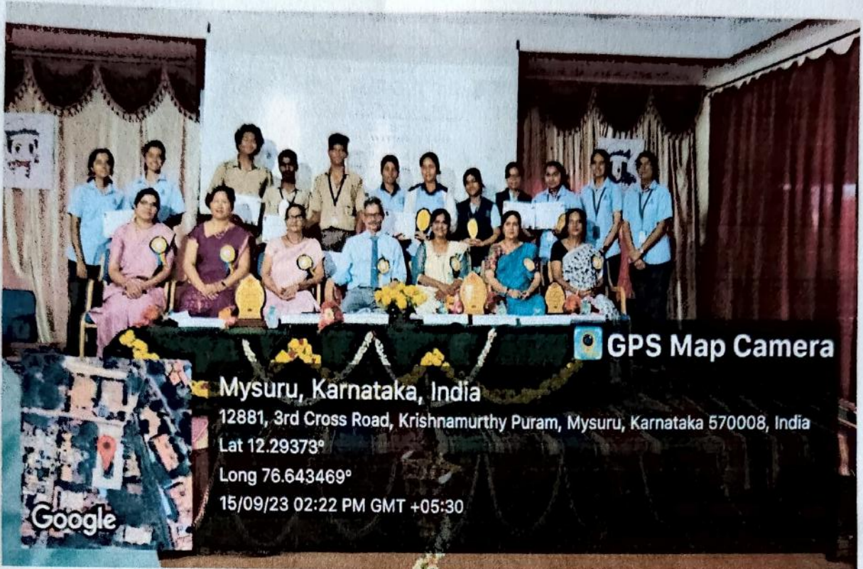
Group photo of the Prize Winners at the Valedictory Function