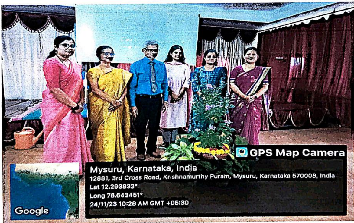
Dignitaries and Organizers during the Inauguration