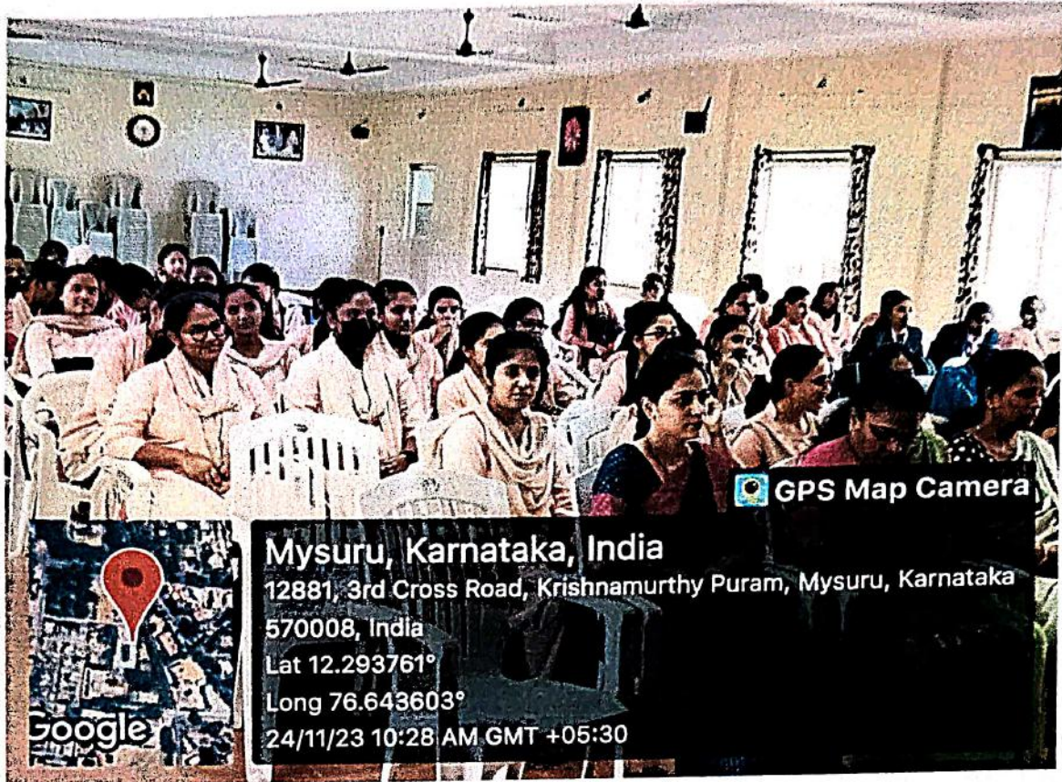
Participants of the One Day Seminar on Intellectual Property Rights