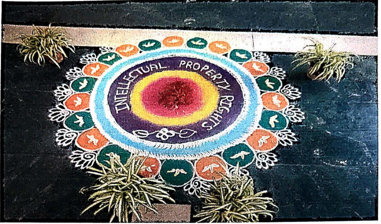
Rangoli prepared by the students on Intellectual Property Rights