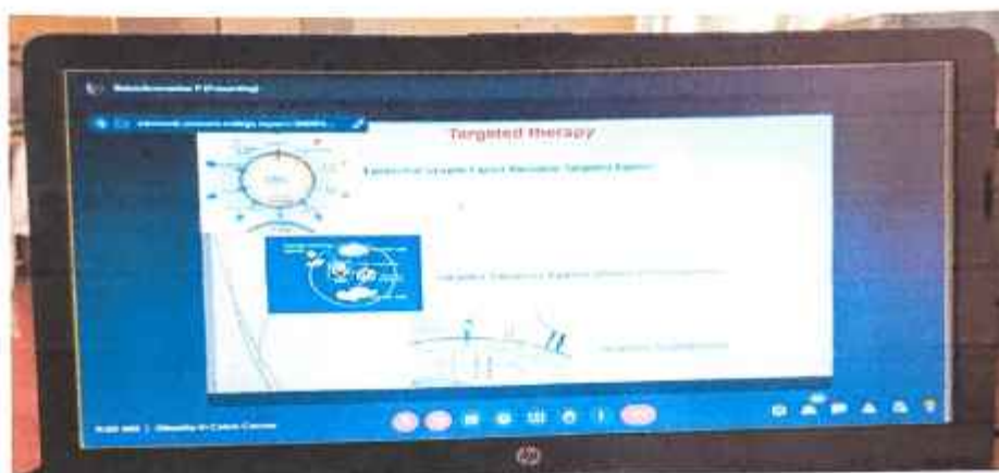
Intercollegiate International Webinar on "Biosparkles - Colon Cancer in Obesity"

SUMMARY: The speaker highlighted on the causes, diagnosis and remedies of colon cancer. He mentioned that the contribution of diet and nutrition status to cancer risk has been a major focus of research as well as public health policy. He conveyed that an increased amount of fat or adipose tissue in an overweight or obese person probably influences the development of cancer by releasing several hormones like factors or adipokines. The speaker detailed on lifestyle factors causing obesity like unhealthy lifestyle choices, such as a diet high in processed meats and low in fruits and vegetables, sedentary behaviour, smoking and excessive alcohol consumption, can increase the risk of cancer. Chemoprevention intervention studies have been carried-out to evaluate the effect of various strategies such as dietary modifications, vitamins and antioxidants, folate, fiber, calcium supplementation, aspirin therapy, etc. was explained. The statistics of the disease, symptoms and stages were elaborated. Individuals with a family history of colorectal cancer or certain genetic conditions may benefit from genetic counselling and genetic testing to assess their risk and determine appropriate screening measures was mentioned.