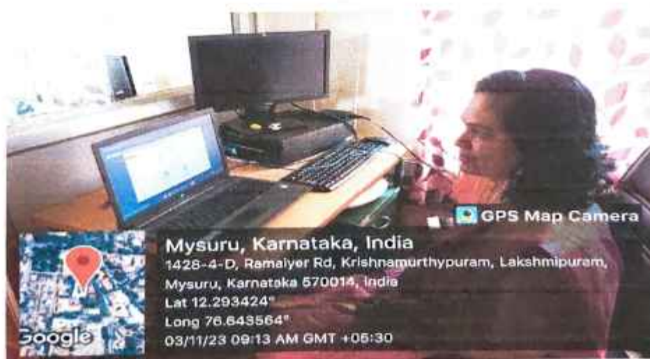
Intercollegiate International Webinar on "Biosparkles - Colon Cancer in Obesity"