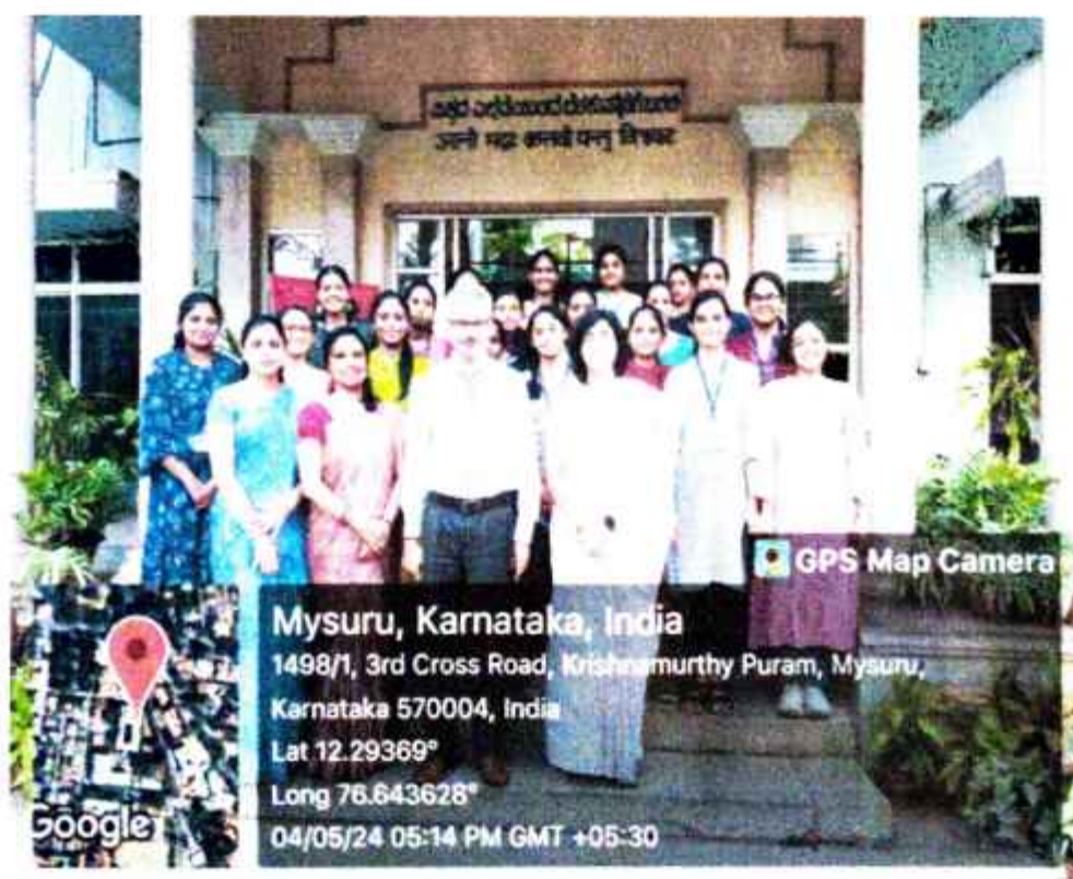
Biosparkles– Hands on Workshop on Fundamentals in Bioinformatics