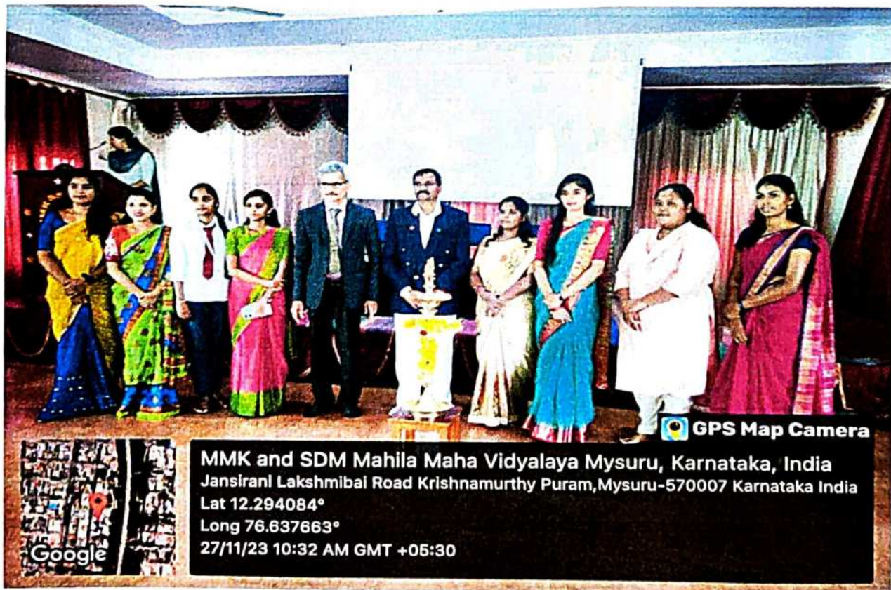
A moment right after dignitaries lighting the lamp