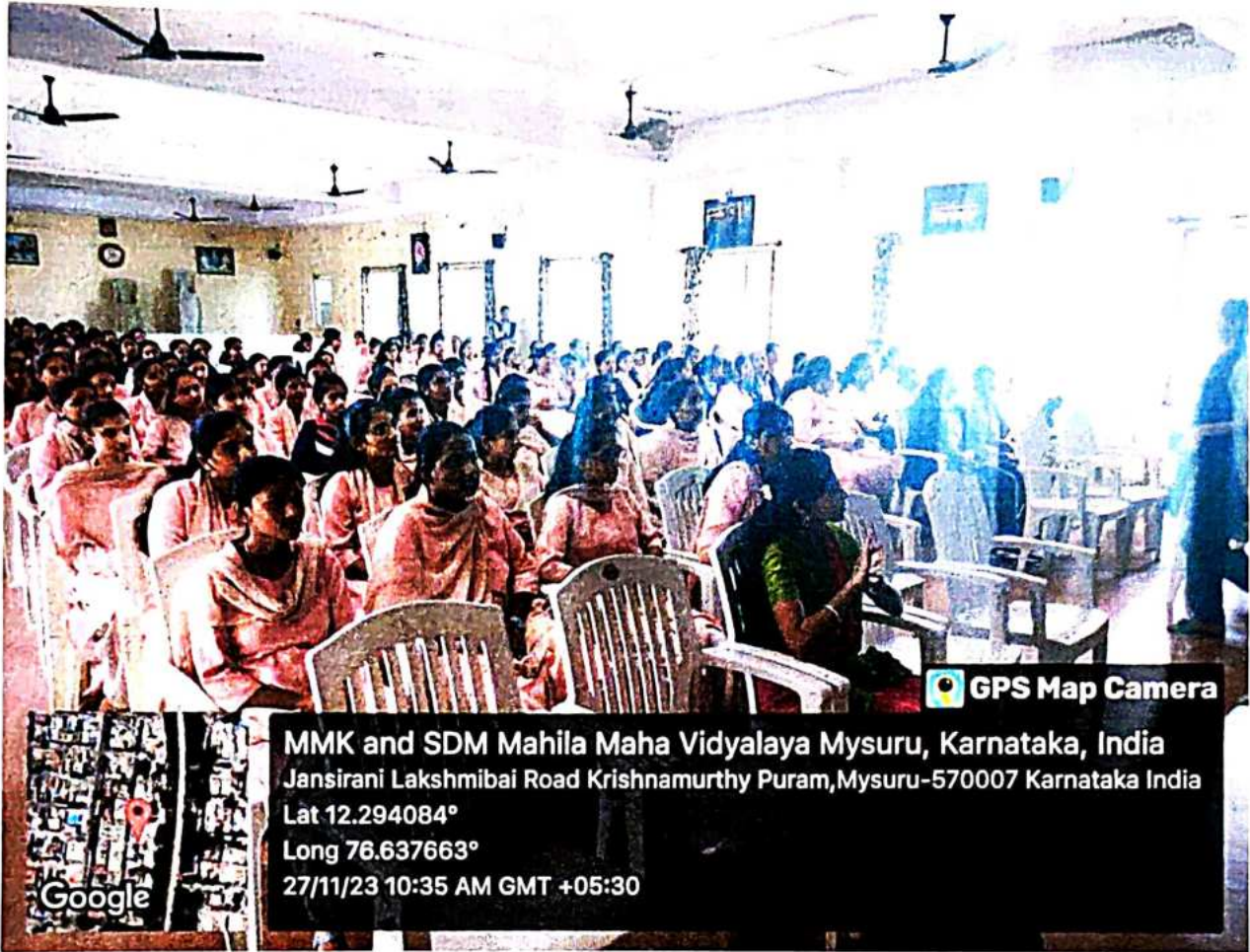
Students gathered at the inauguration of Constitution Day programme

PRINCIPAL MMK & SDM Mahila Mahavidyalaya Krishnamurthypuram, Mysore-570 004