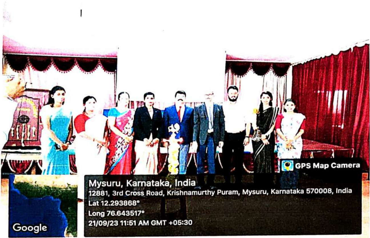
Inauguration of Drug Abuse Prevention Programme