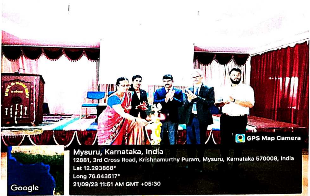
Dignitaries lighting the lamp