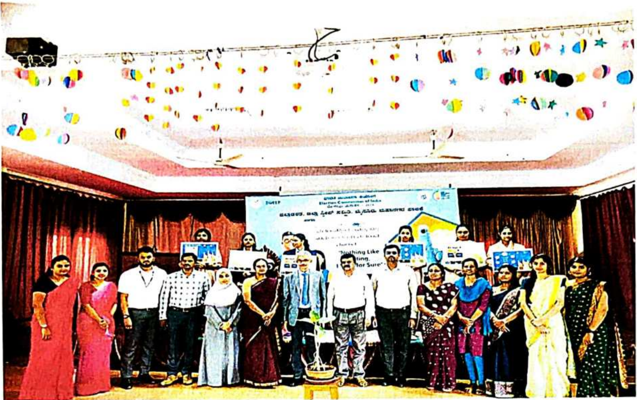
College and MCC authorities during the inauguration of Voter's registration