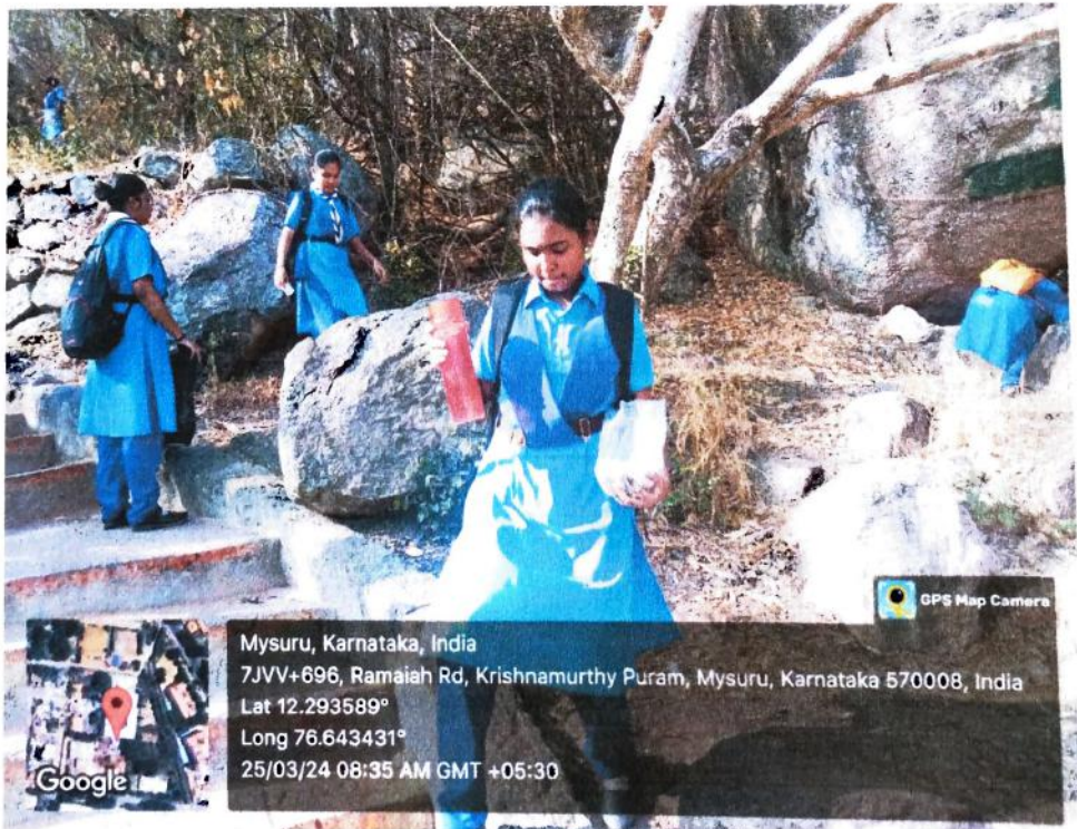
Chamundi hill hiking and cleaning programme