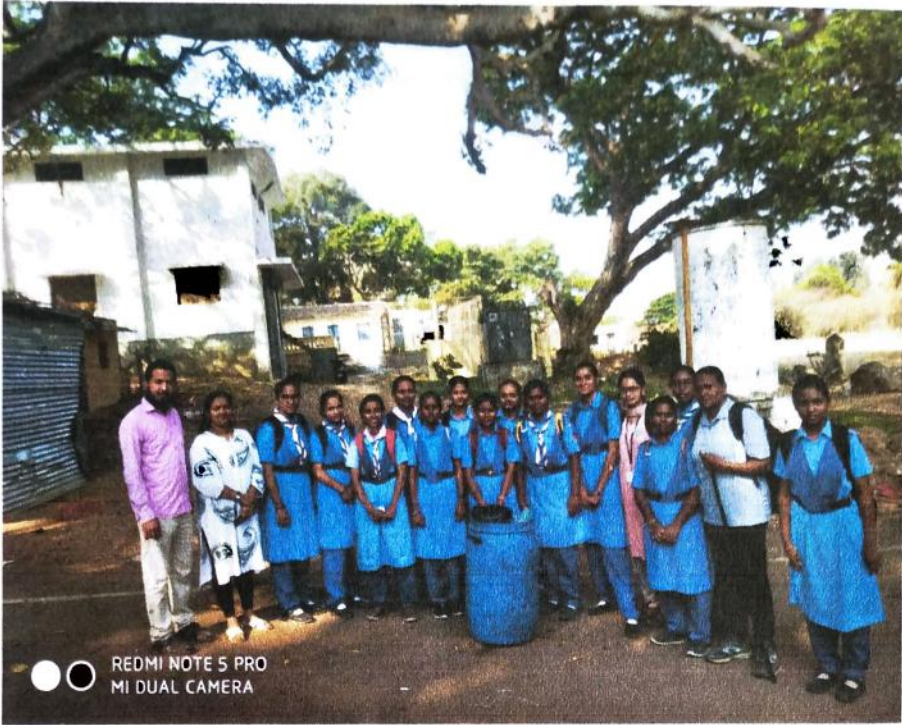
Chamundi hill hiking and cleaning programme