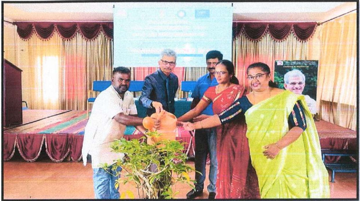
Inauguration of National Science Day Program