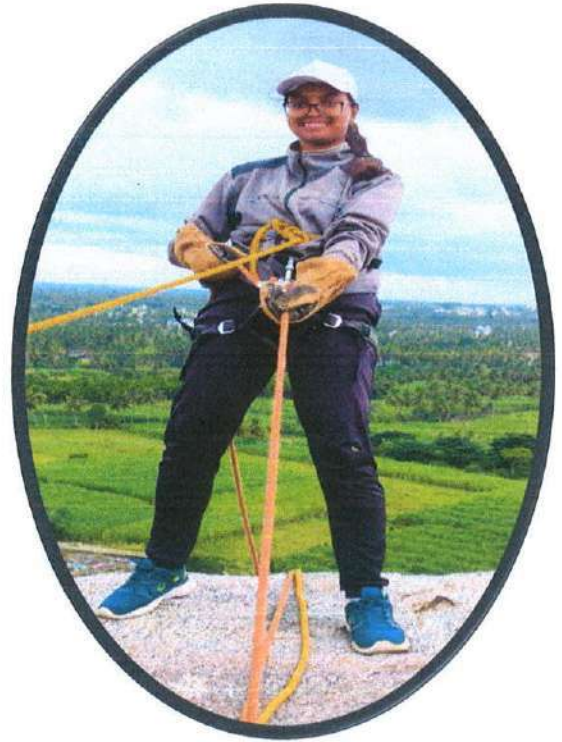
90 degree rock dropping down