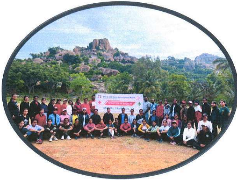
College team along with trainers