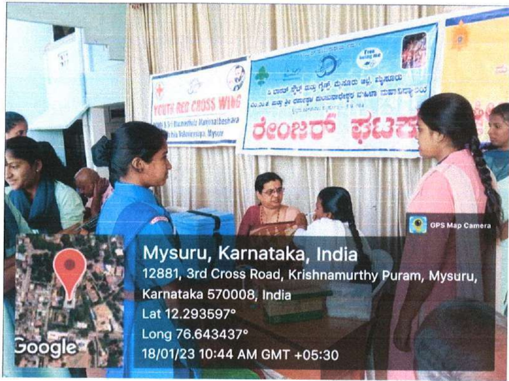
Students serving on the occasion of vaccination Drive