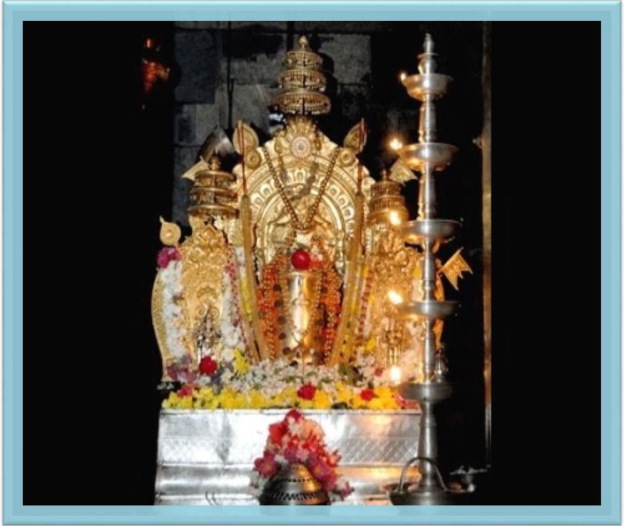
Lord Manjunatheshwara Dharmasthala