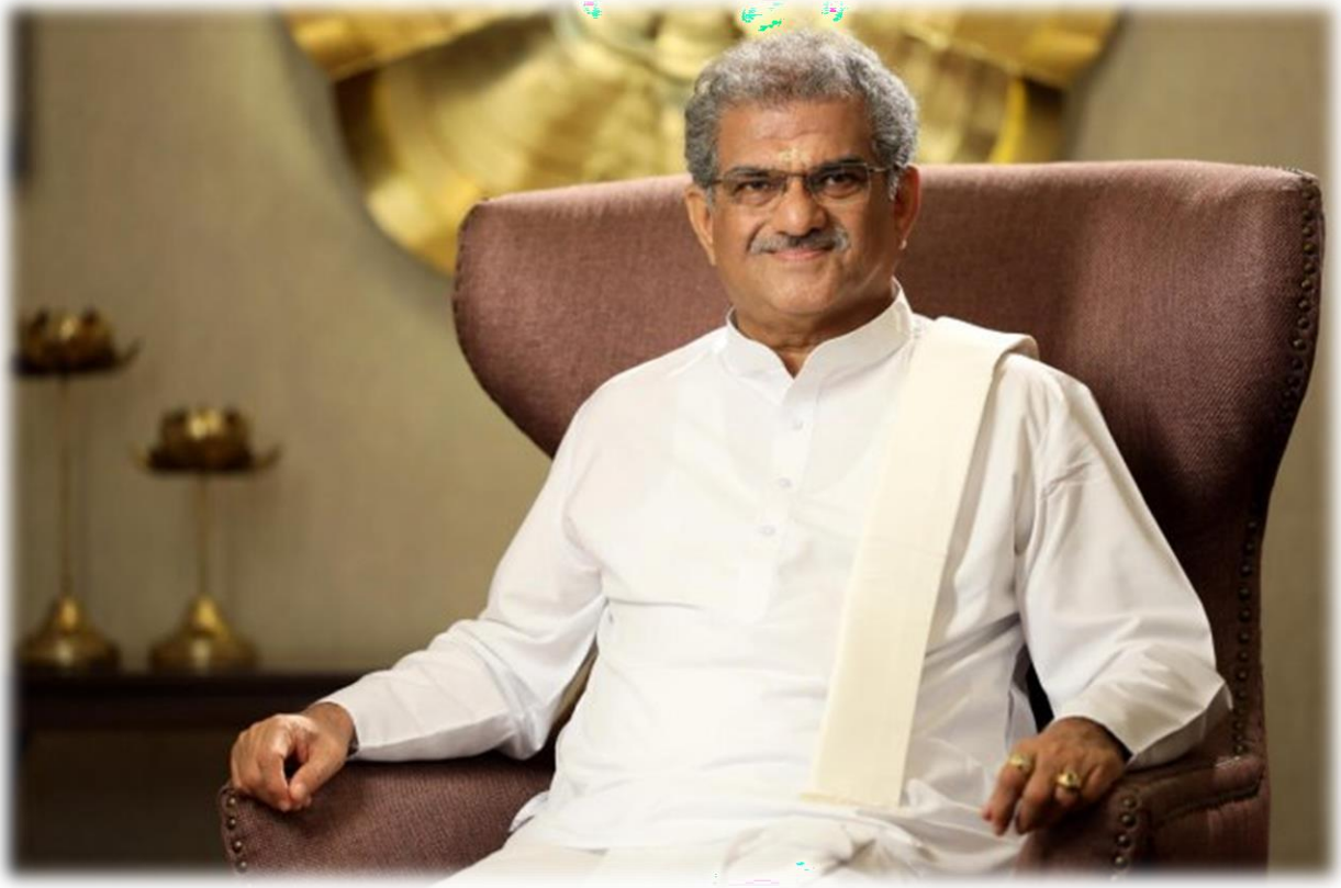
Poojya Dr.D.Veerendra Heggade