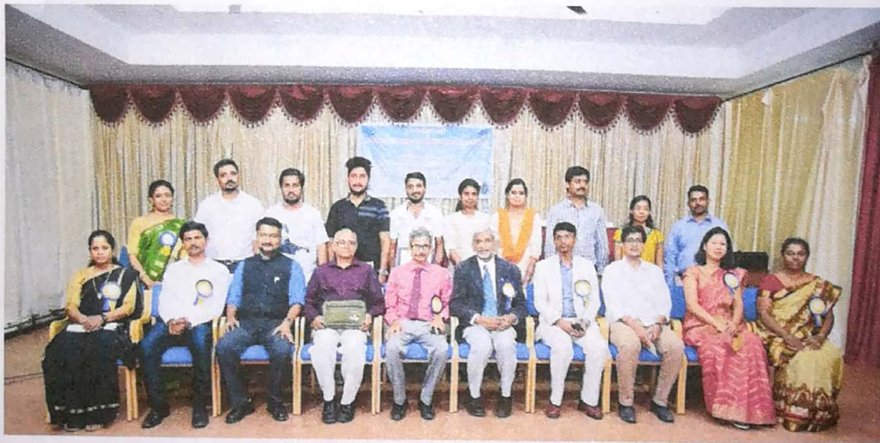
Seen in Picture (Standing) Prize winners of Oral and Poster Presentation.