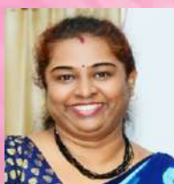
Organizing Deputy Secretary